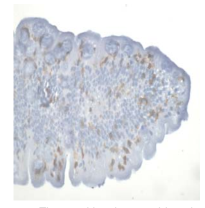
Figure 4. The positive immunohistochemical reaction with a dark brown precipitate in the cell membrane of T lymphocytes, CD3+, LSAB 2, 100